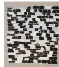
Diagram showing method of weaving draft notation (plain weave) , Plate 10 from On Weaving , 1965

© The Josef and Anni Albers Foundation, VEGAP, Bilbao, 2017