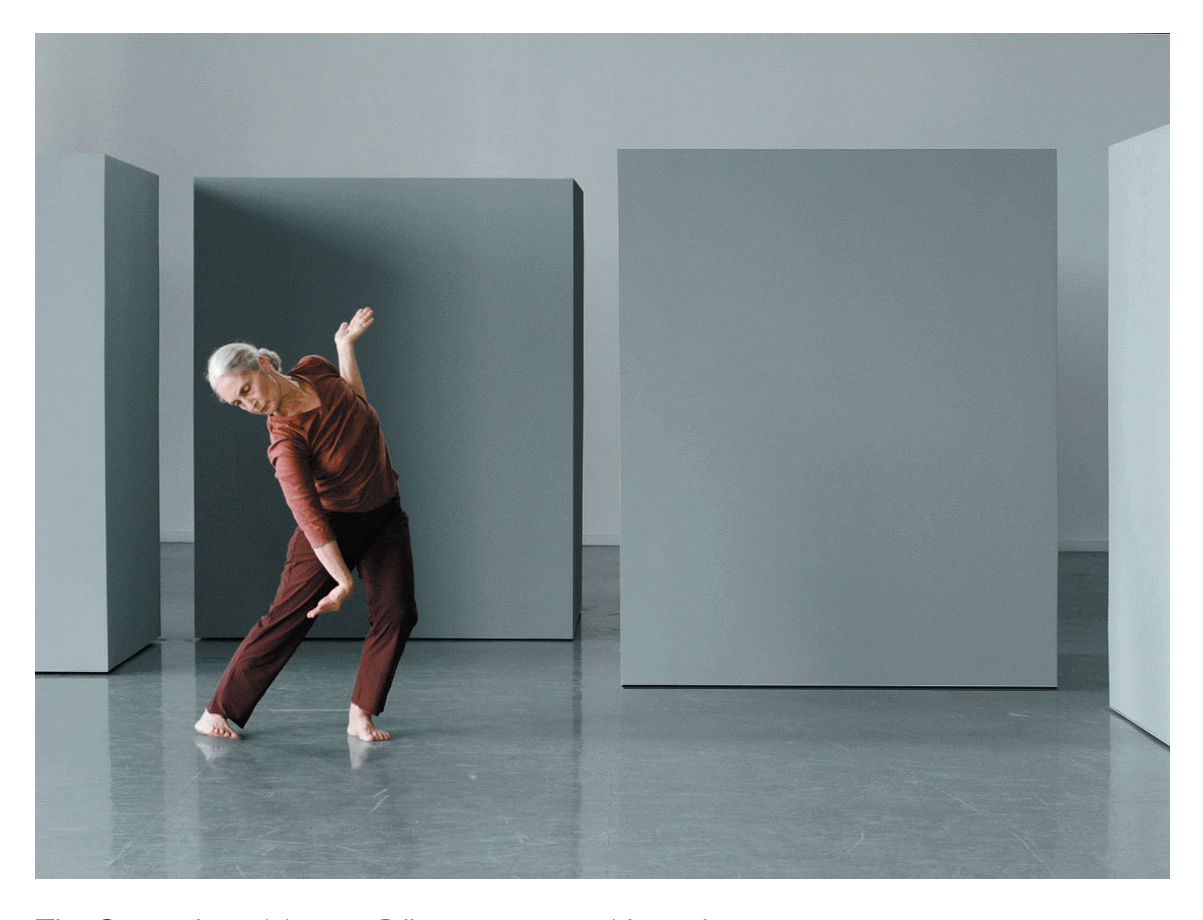
The Guggenheim Museum Bilbao presents on November 4, 2021